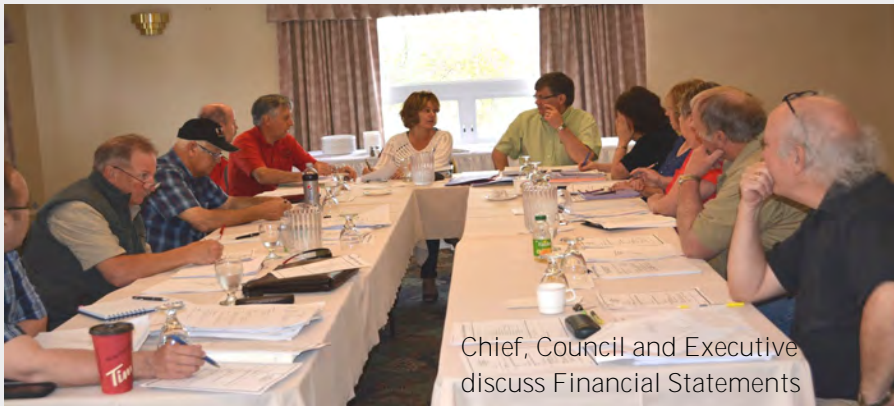
Chief, Council and Executive discuss Financial Statements