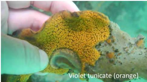
Violet tunicate (orange)

Golden star and violet tunicates were first detected in western Newfoundland in 2013. The invasive golden star and violet tunicates are brightly coloured animals that form a spongy like film on algae, eelgrass and wharves.