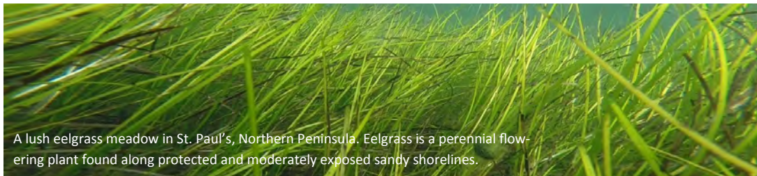
A lush eelgrass meadow in St. Paul's, Northern Peninsula. Eelgrass is a perennial flowering plant found along protected and moderately exposed sandy shorelines.

Both golden star and violet tunicates can be found on the submerged portions of floating docks or attached to buoys and submerged ropes around wharves. These species are known to grow on algae, such as kelp and rockweed, and recently have been found growing on eelgrass. The presence of these two species on eelgrass is thought to reduce growth and productivity, which is putting additional pressure on this important habitat. Eelgrass is a complex habitat that houses numerous invertebrate species, stabilizes coastal shores, and acts as nursery ground for numerous fish species. Both green crab and invasive tunicates have been found to negatively affect eelgrass habitat in Atlantic Canada.