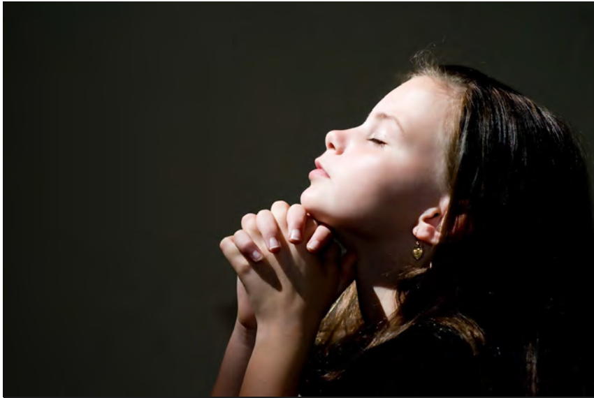
Anyone can pray. There are no rules, exclusive gender, or special protocol to speak to Kisu'lk (Creator)