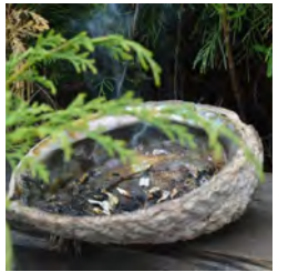
A few highlights from National Aboriginal Day Celebrations. Photos submitted from St. George's, Corner Brook, Badger, and Glenwood