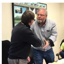
A Visit from CAP National Chief Bertrand