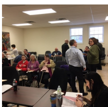
Membership Question and Answer