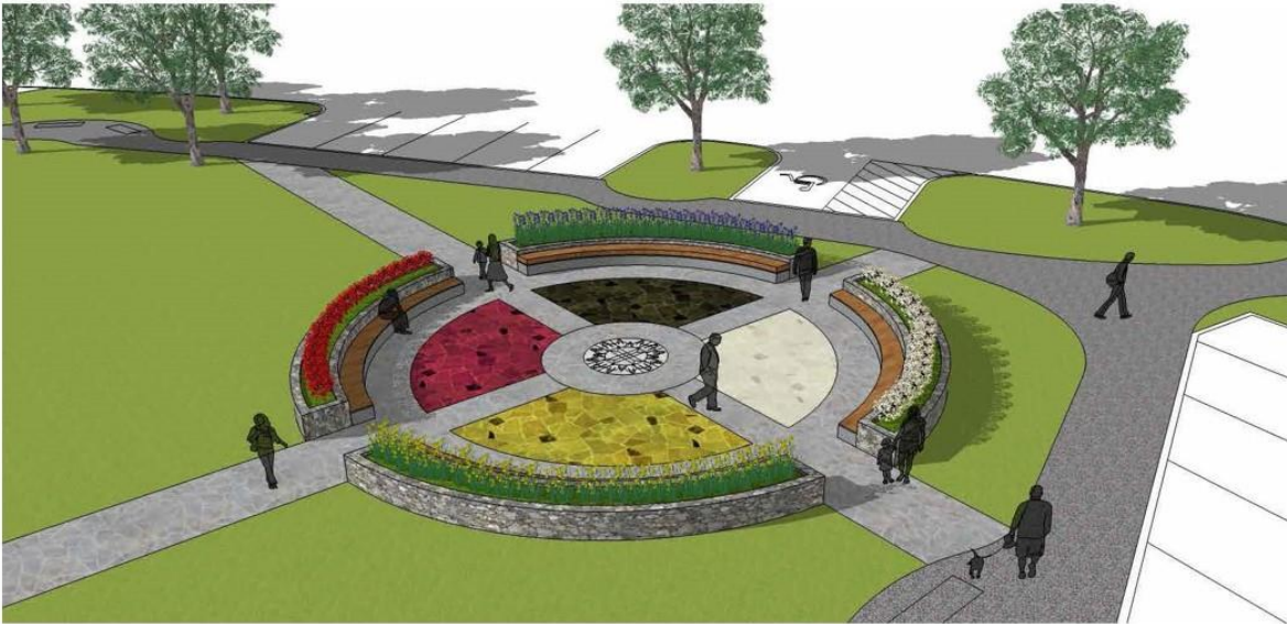
Missing and Murdered Indigenous Women and Girls Commemoration Fund - Healing Garden Qalipu First Nation