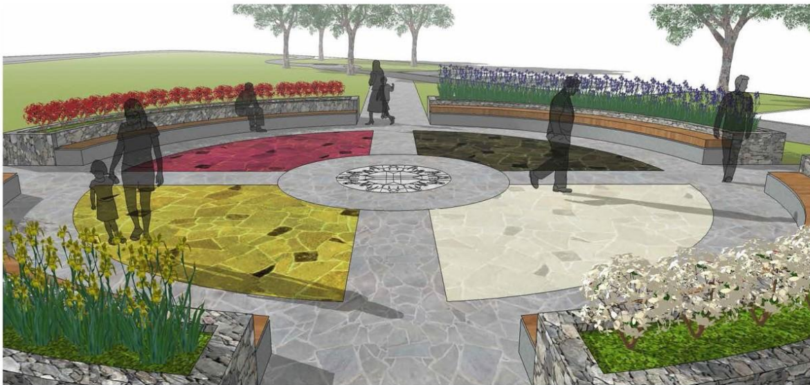
Missing and Murdered Indigenous Women and Girls Commemoration Fund - Healing Garden Qalipu First Nation