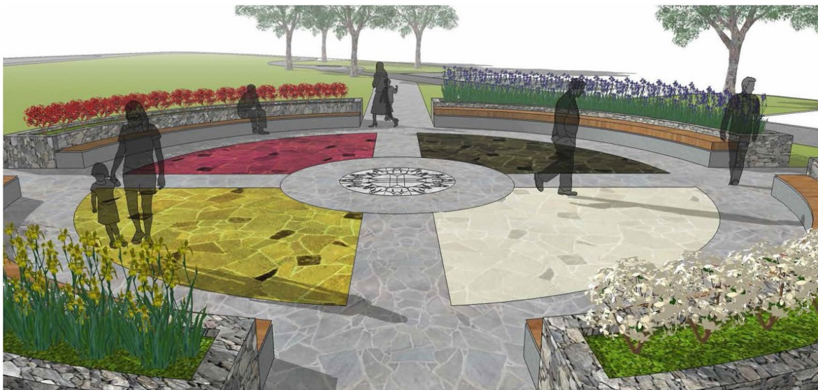
Missing and Murdered Indigenous Women and Girls Commemoration Fund - Healing Garden Qalipu First Nation