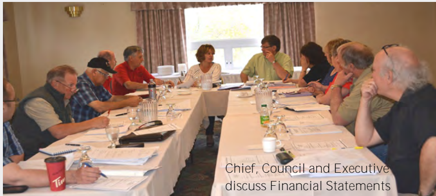
Chief, Council and Executive discuss Financial Statements