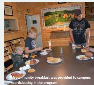
A community breakfast was provided to campers participating in the program