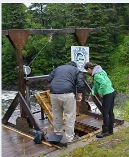
QMFN & SPAWN Summer Students performing their daily check

The first salmon to appear in the trap was approximately 10-12lbs on July 13. A little later than in past years but it is believed to be because of low water levels in Corner Brook Stream. As of July 31, the count of salmon is at 27, the largest being approximately 20-22 lbs. with several other fish in the trap. "It took a while before they would leave but a few up and down shifts of the cage and off they went."