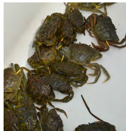
Top Left: Tagged Green Crab.